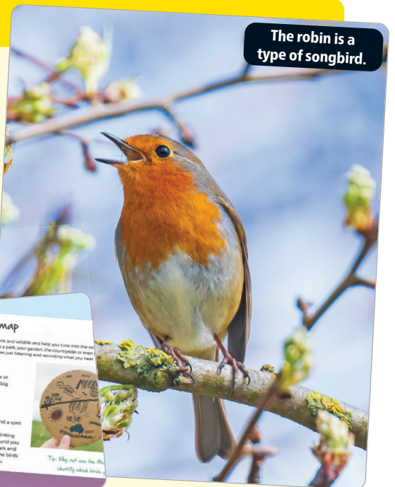
The robin is a type of songbird.